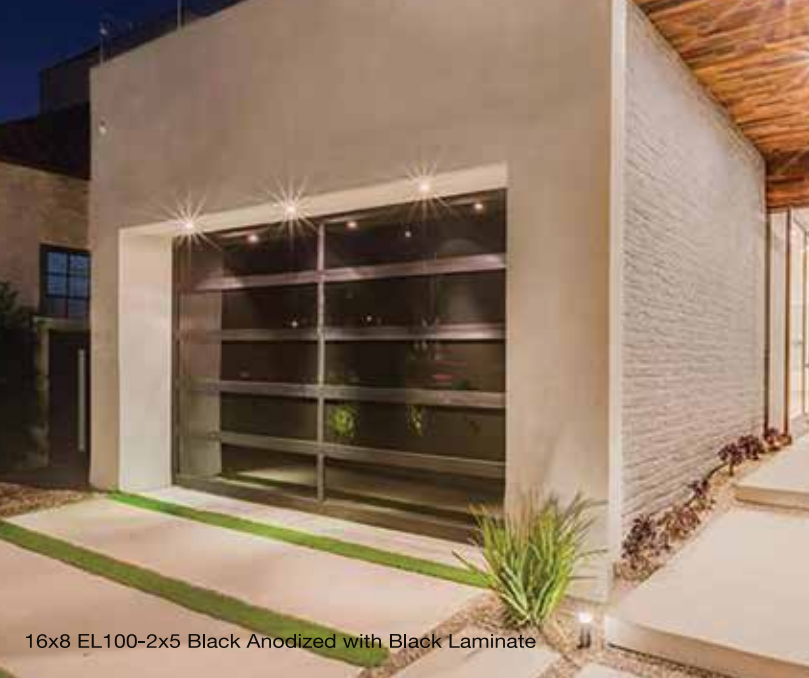
16x8 EL100-2x5 Black Anodized with Black Laminate