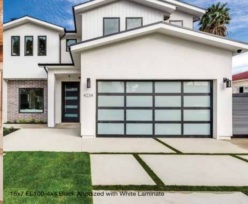
16x7 EL100-4x4 Black Anodized with White Laminate